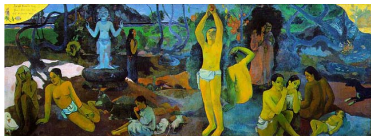
Where Do We Come From? What Are We? Where Are We Going? Paul Gauguin, 1897-98

If you happen to be at ISA EXPO 2006 October 17-19, stop by and wish us Happy Birthday!