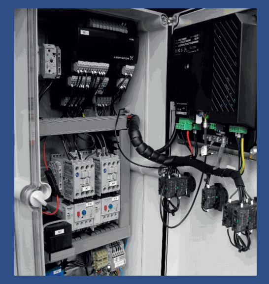
Sewage pump controller with a CIM 250 module and GSM/GPRS modem are to the right.

Data is communicated wirelessly every 10 minutes to the central SCADA system. In an alarm situation, the SCADA system ensures correct alarm handling.