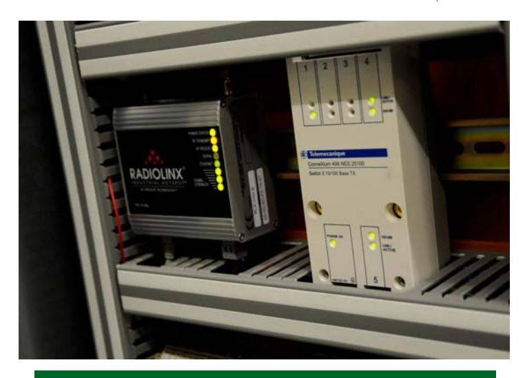
ProSoft Technology RadioLinx industrial Ethernet radio & Schneider Electric ConneXium 499 NES 25100